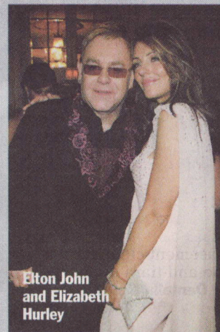
Elton John and Elizabeth Hurley

Vera Wang, in addition to readying her Simply Vera line for Kohl's Department Stores, has started work on a new women's fragrance, which she described as "very rock 'n' roll, mixed with red carpet and Park Avenue."